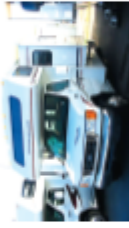
'05 MINNE 29'

MSRP .....$84,171 SALE PRICE .....$62,862 YOU SAVE .....$21,309