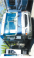
'05 GEORGETOWN XL32'

MSRP .....$107,868 SALE PRICE .....$78,804 YOU SAVE .....$29,064