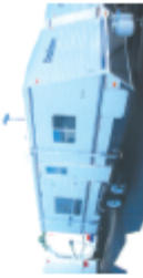
'05 DUTCHMEN 27'

MSRP .....$32,231 SALE PRICE .....$21,227 YOU SAVE .....$11,004