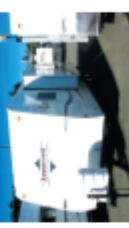
'05 AEROLITE 25'

MSRP .....$25,003 SALE PRICE .....$16,974 YOU SAVE .....$8,029